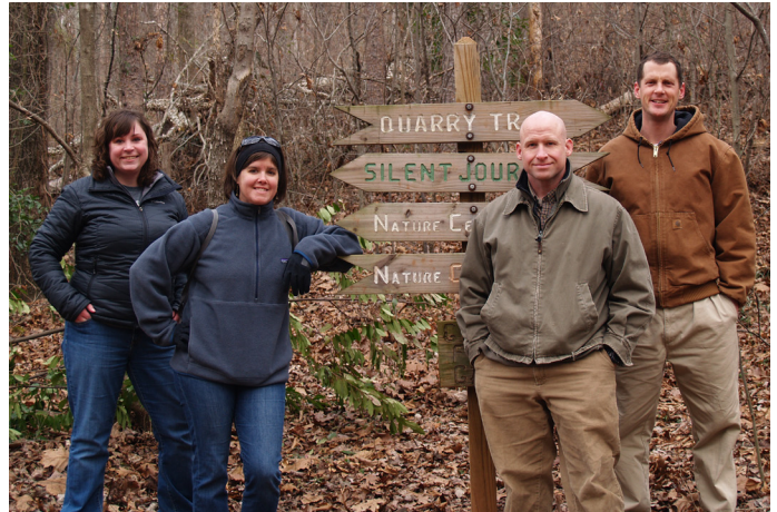
Alabama Rivers Alliance staff at Ruffner Mountain Nature Preserve.

The governor released the Alabama Water Agency Working Group's report in April of 2014, and the Alabama Rivers Alliance followed with the Tuscaloosa symposium, which offered citizens their first chance to ask members of