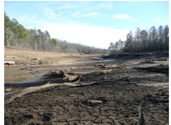
Lake Purdy, source of Birmingham drinking water, in 2016.

No state agency is empowered to step in when water overuse threatens the security of Alabama’s water resources. The drought crisis of 2016 exposed the flaws in Alabama’s current system. The flows in many streams and rivers across the state were severely reduced due to continued water withdrawals during a declared state of emergency. All over Alabama, there were clear examples of streams getting dangerously low or even drying out completely because of unchecked water withdrawals.